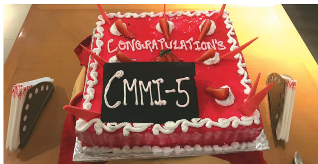
SDMS Team celebrating the achievement of CMMI-5 Level Milestone