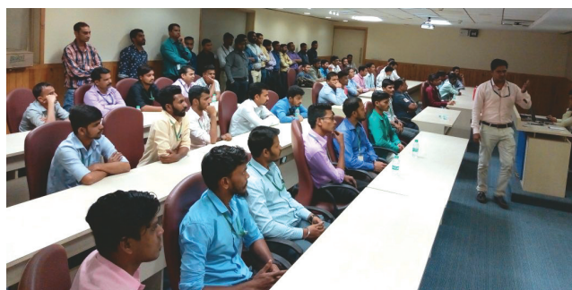
Safety Training Program was organized for the employees