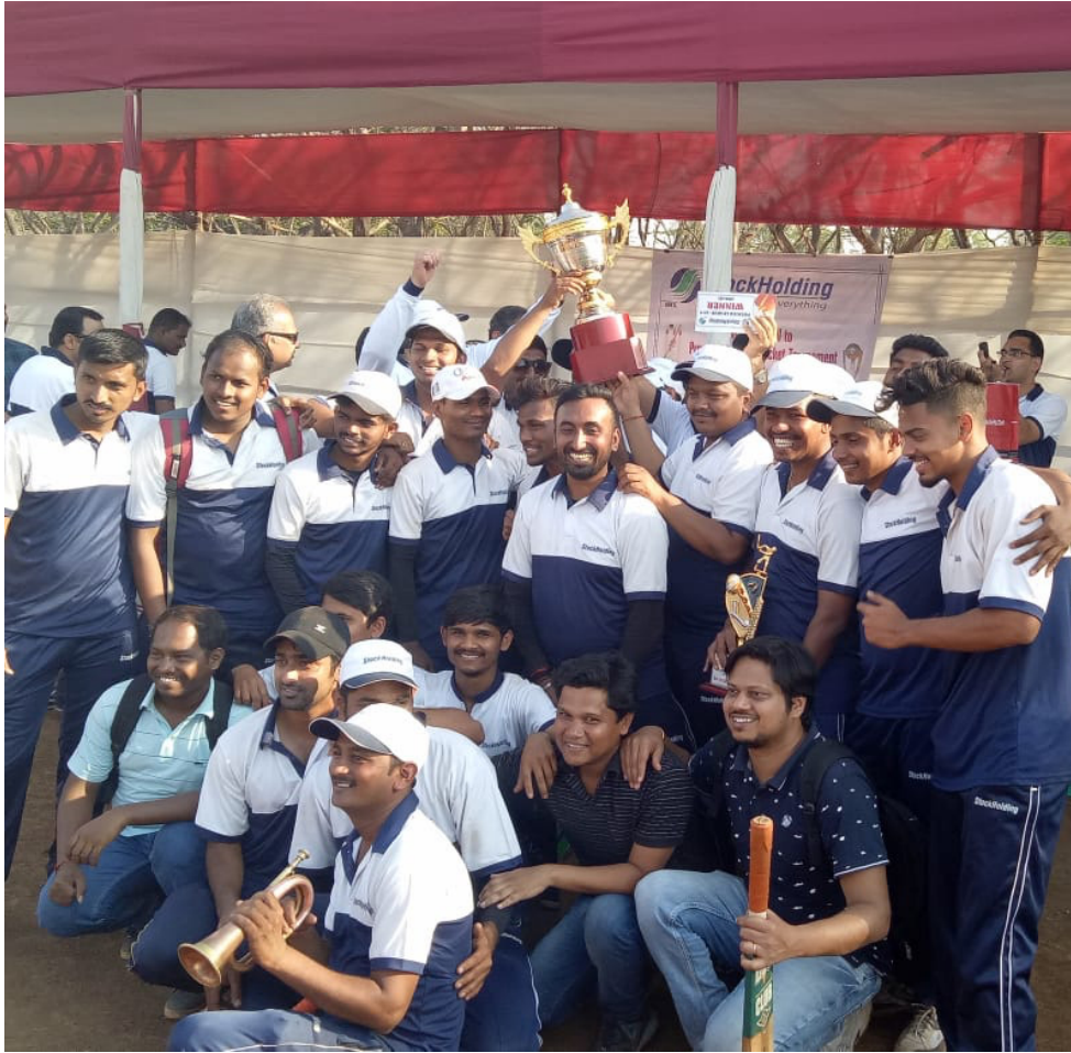
Winning team of SDMS in Inter StockHolding Group (Men) Cricket Tournament held at Vashi Sports Club, Navi Mumbai