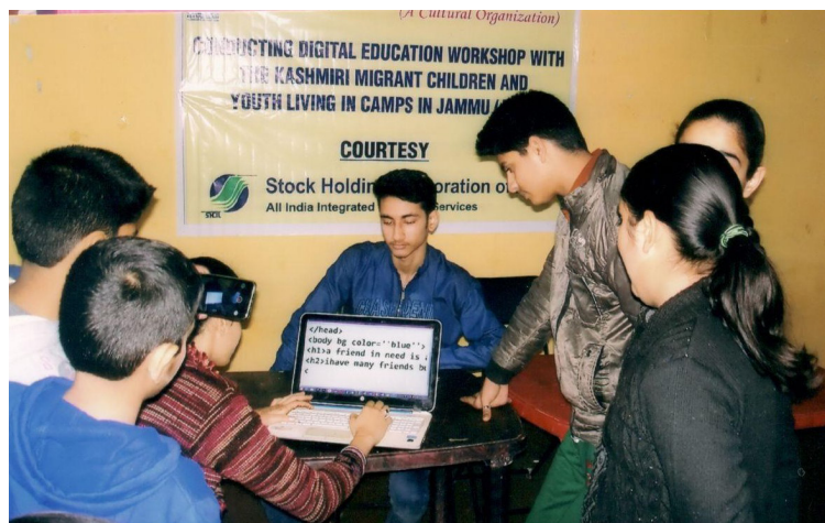
SHCIL Foundation, as a part of SDMS CSR initiative, partnered with Socio Service Art Group to conduct a Digital Education Workshop for Kashmiri Migrant Children & Youth Living in Camps in Jammu (J&K)