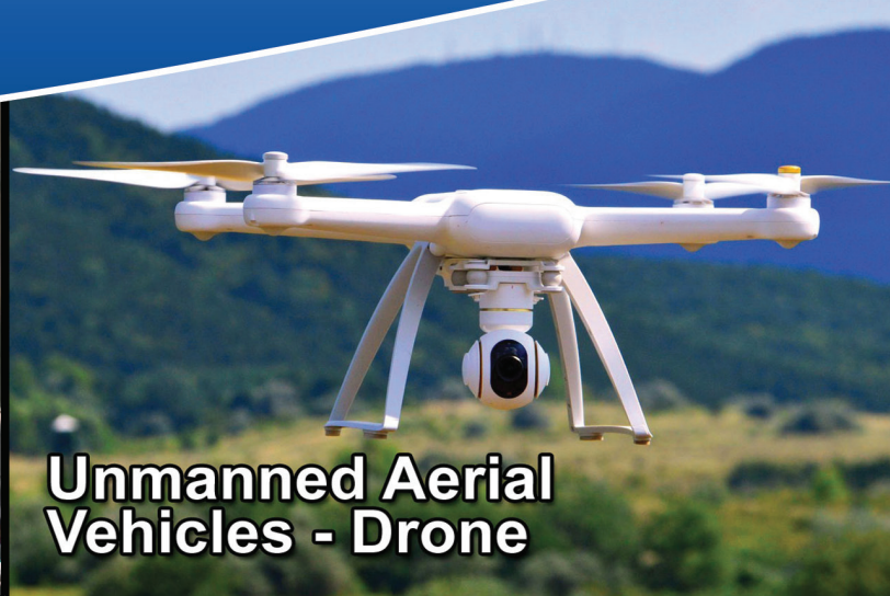
Unmanned Aerial Vehicles - Drone