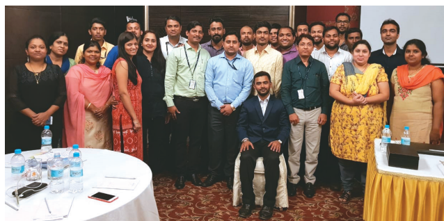
E-Mail Etiquette Training Program was organized at Hotel Majestic Court Sarovar Portico.

Apart from internal training programmes, employees were nominated to external programmes for better exposure to industry practices and new trends in areas such as IT, Finance, Marketing conclaves, etc. organized by Training Institutes of repute.