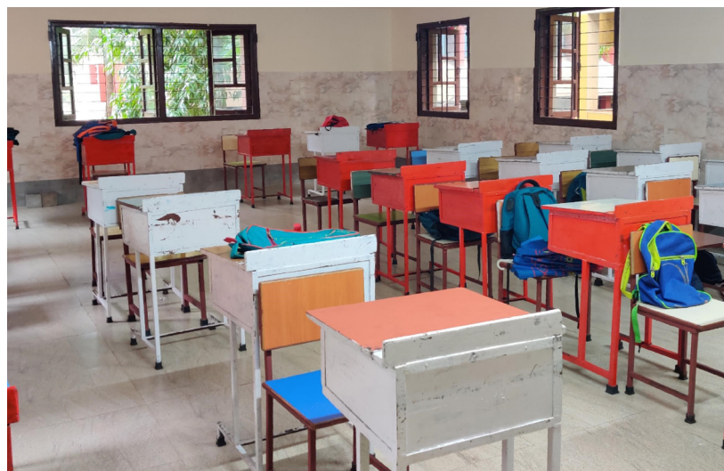
SDMS has contributed towards the refurbishment of toilets and study room at Agnells Balbhavan, Vashi, Navi Mumbai – a home for orphans and underprivileged boys through SHCIL Foundation.